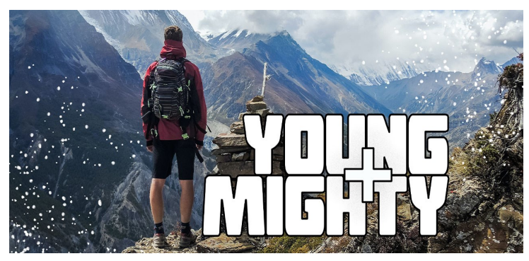
Destroying the Giants in my Life October 22 & 23, 2022