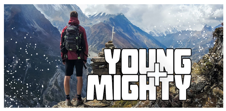
Destroying the Giants in my Life October 22 & 23, 2022